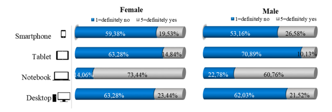
Fig.2. Device preferences for online purchasing from a gender perspective

Continuing the investigation we continued to verify the established hypothesis, to which we used a nonparametric parallel test of parallel profiles. The following Table 3 determines the average and standard deviation values defined to the matter under consideration.