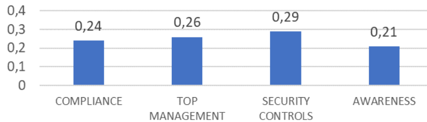
Figure 1. The weight of the factors

Based on the (r-c) values, the specified four factors were divided into the cause group (4) and the effect group (1). The positive value of (r-c) of the factor classified it to the cause group that directly affected the others. The highest (r-c) valued factors also had the greatest direct impact on the others. The factors F2 (1,94), F1 (0,71) and F3 (0,12) belong to cause group in our case study.