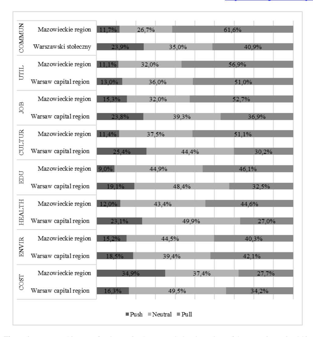
Figure 1. Factors pushing out of and attracting human capital to the regions of the Masovian Voivodship

ISSN 2345-0282 (online) <a href="http://jssidoi.org/jesi/2021">http://doi.org/10.9770/jesi.2021.9.2(3)</a>