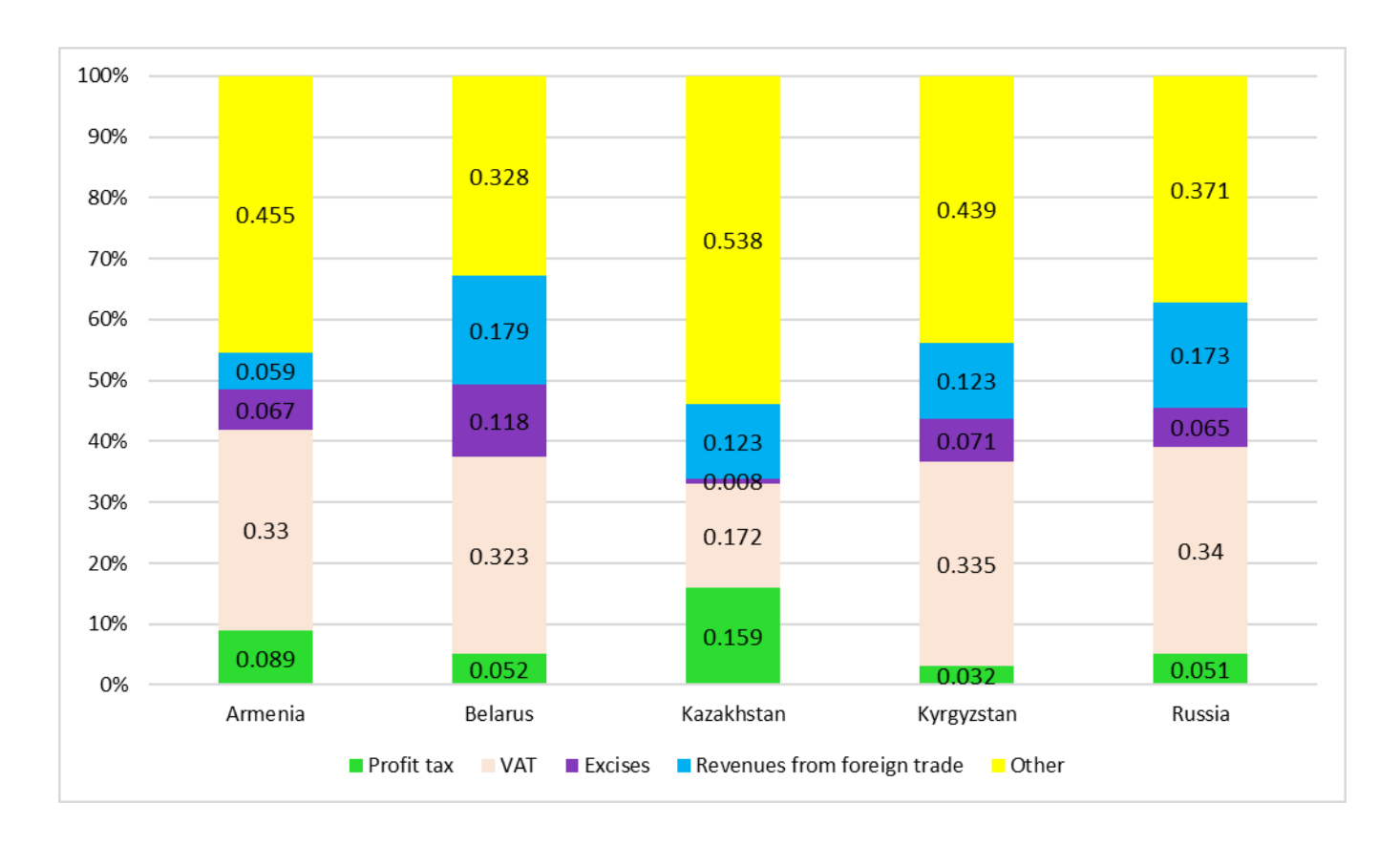
Fig. 1. Tax revenue structure in the EAEU member countries in 2017. Source: Financial statistics of the Eurasian Economic Union, 2018.

The major budget-forming tax for the EAEU countries is VAT (Fig. 1).