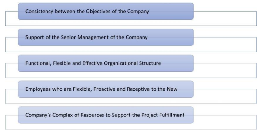
Figure 3. 5 factors which can favour the development of the intrapreneurial environment within a company.

It is recognised in developed countries that intrapreneurship culture should be encouraged inside the organisation: intrapreneurship and innovation are the key drivers of sustainable growth (Kungu et al. 2020); however, more traditional and bureaucratic organisations might find these processes rather difficult to implement (Kaleem et al. 2019). On the other hand, the competitive environment in developed countries encourages companies to find new ways to promote their products or create innovative solutions which could differentiate them from other peers. Finding talented people and promoting intrapreneurship or new technologies are significant in high-tech organisations (Kaleem et al., 2019). Therefore, a specific environment and rules must be implemented (Ali et al., 2020) via training programs for employees and the opportunity to experiment. In parallel with the innovative climate, companies must be ready to invest financial and physical resources, enabling employees to learn and innovate, see new opportunities and feel valuable. Thus, a company which promotes intrapreneurship (Ali et al., 2020) should possess an adequate reward system for the employees' accomplishments while tolerating learning from the mistakes approach and encouraging them to take risks. Codrinlescu and Bolcas (2019) underlined the five most important factors which can promote the development of the intrapreneurial environment within a company (see Figure 3).