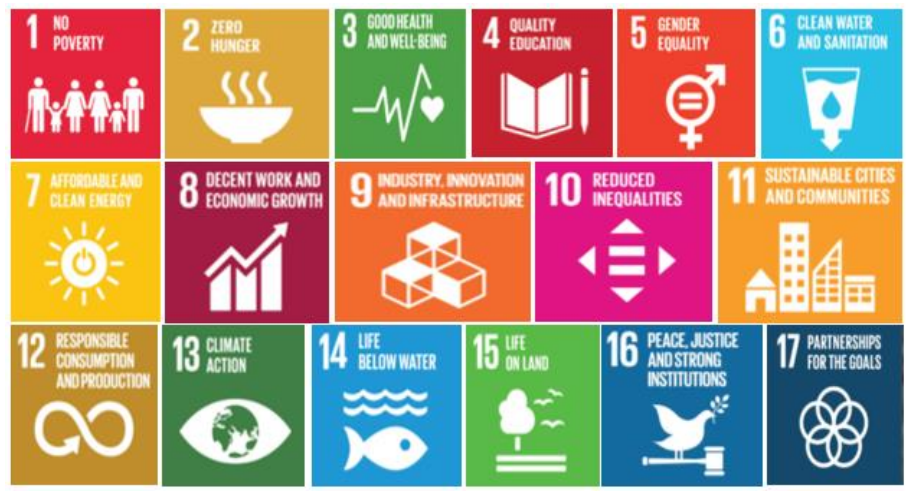
Figure 1. The 17 UN Sustainable Development Goals (SDGs) ("THE 17 GOALS | Sustainable Development," n.d.)

ISSN 2669-0195 (online) <u>http://jssidoi.org/jesi/</u> 2022 Volume 4 Number 2 (June) http://doi.org/10.9770/IRD.2022.4.2(2)