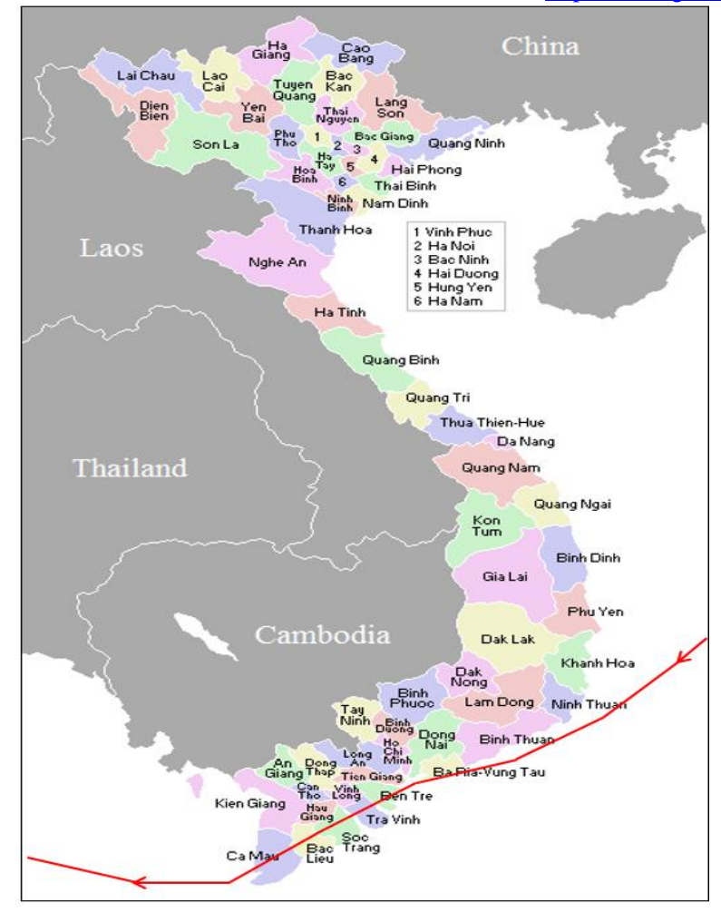
Figure 1 . Map of Vietnam and track of typhoon Durian

ISSN 2345-0282 (online) http://jssidoi.org/jesi/ 2020 Volume 8 Number 1 (September) http://doi.org/10.9770/jesi.2020.8.1(41)