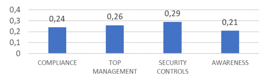
Figure 1. The weight of the factors

ISSN 2345-0282 (online) <a href="http://jssidoi.org/jesi/2019">http://jssidoi.org/jesi/2019</a> Volume 6 Number 4 (June) <a href="http://doi.org/10.9770/jesi.2019.6.4(37)">http://doi.org/10.9770/jesi.2019.6.4(37)</a>