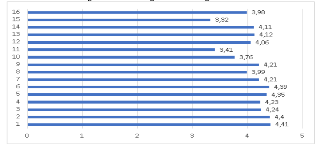
Figure 3. Assessment of the situation of employees in the organisation, taking into account their individual differences (n=202, average values, max=5)

the survey data, it can be seen that there is a lack of effort geared and attention paid towards organizing trainings, seminars and using mentorship programs, oriented at forming a positive attitude of employees towards colleagues of different sex, work style, disability and other individual specifics (M=3.41). The low estimate scores also suggest that organisations lack regular employee surveys, discussions with managers or colleagues to improve the work environment oriented towards achieving inclusion and diversity (M=3.32). These results suggest that the lack of information on the individual differences and needs of different groups may be one of the obstacles to the development and implementation of employee inclusion in the labour market. The results also revealed the importance of regular surveys to build an inclusive and diverse community in today's labour market, for example through reliable and valid methodologies for measuring and evaluating inclusion.